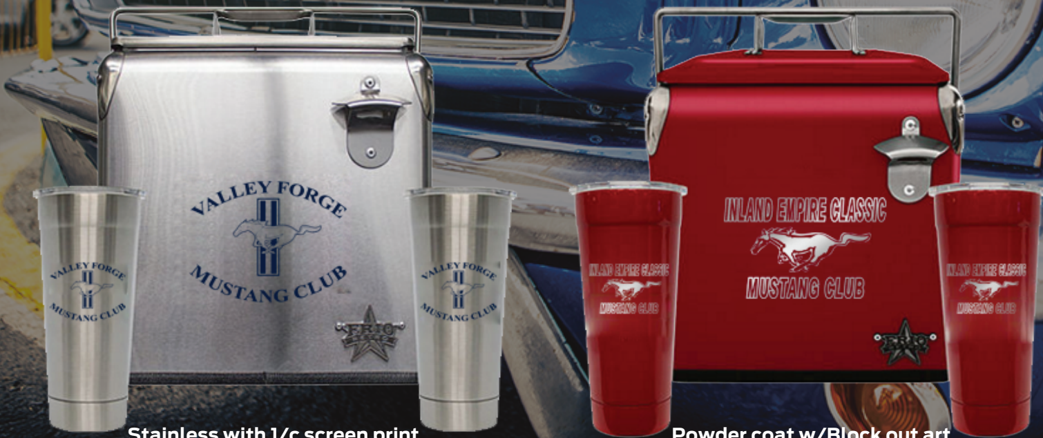
Stainless with 1/c screen print